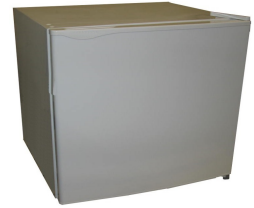
LabMed LM 05..WN