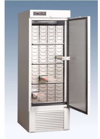
LabMed LM 6025WN