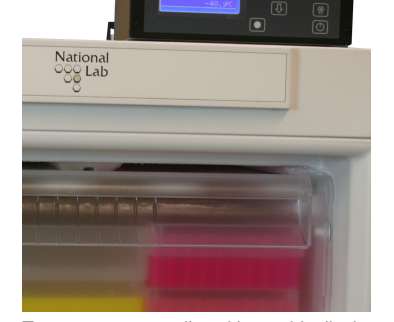
Temperature controller with graphic display and data logger