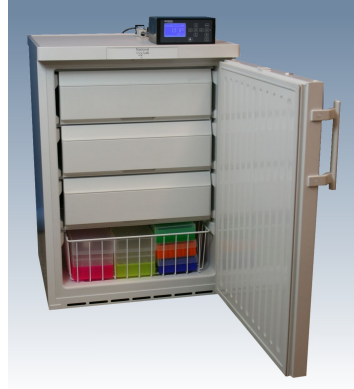
ProfiFrost PFU1447WN **