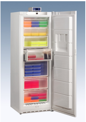
ProfiFrost PF2728WN **