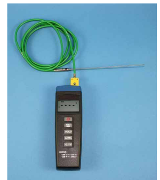
MIN/MAX digital thermometer with add. temperature sensor

Please ask for a personal fitting option.