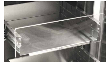
drawer with telescopic slide-out