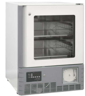
LabStar Sanguis LSSA1104GEWU