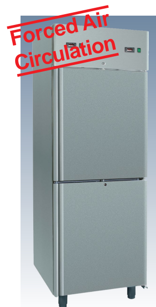
LSSI 7030KEEU (optional with feet)